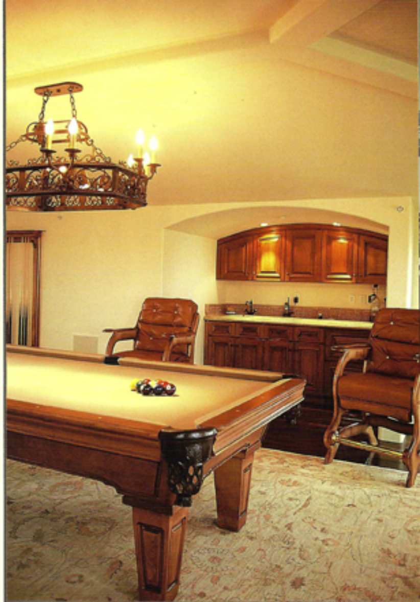
Top right, the wide-open family room on the top level of this Ventura vacation home built by Livingston Construction, Ventura, features custom lighting, view windows of the beach, and a bar.