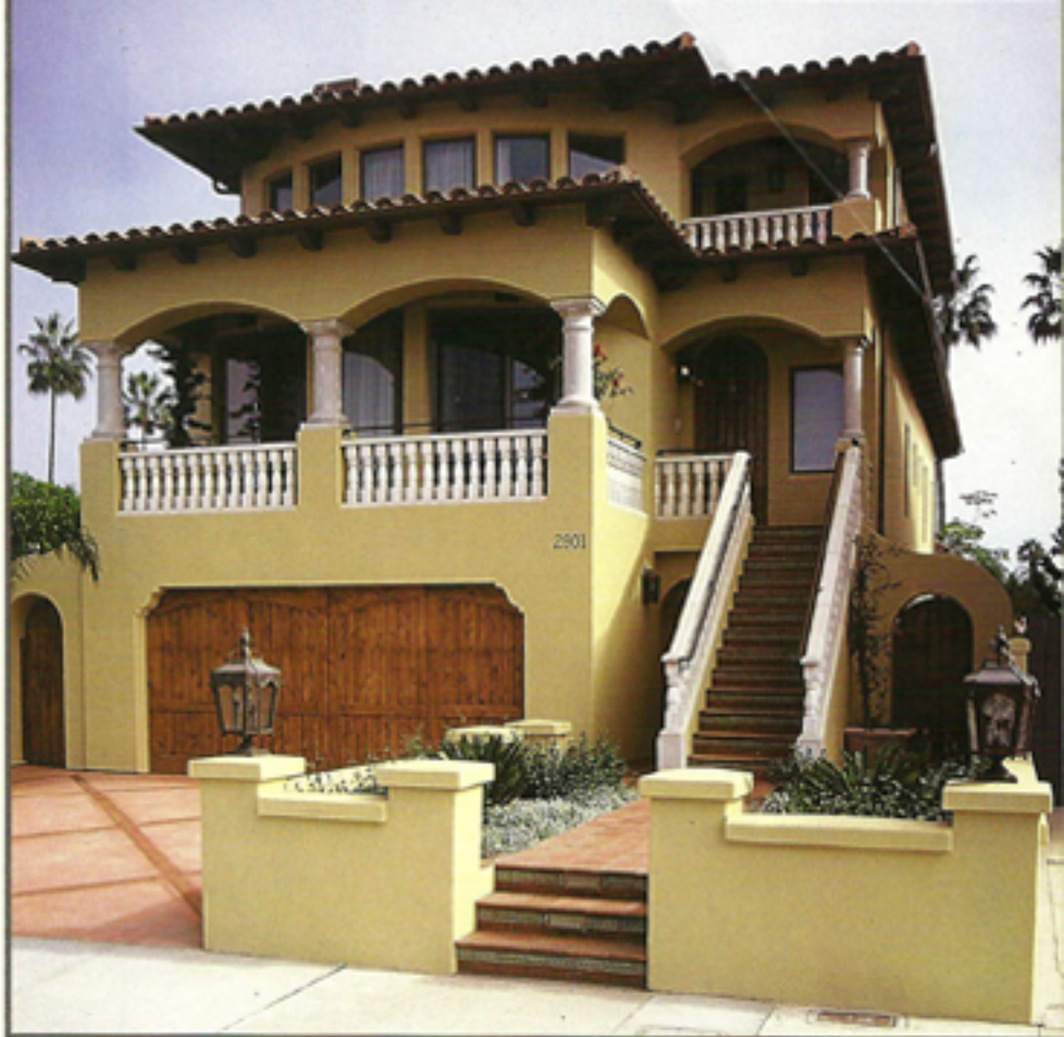
Above, this custom vacation getaway near the beach in Ventura, built by Livingston Construction, Ventura, features view windows, balconies, a large parking area and garage, and fenced, private yard. Below, storage facilities near Ventura Boulevard in Ventura, built by Livingston Construction, are typical of commercial projects the company builds throughout Ventura and Los Angeles counties.